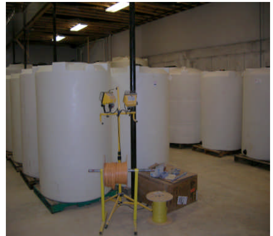
Food Grade Plastic Tanks at a Illinois Winery

Since 1972, Westfall Company, Inc. has supplied a full line of industrial grade equipment. Many of our products are well suited to the winemaking industry. Our HDPE plastic tanks are food grade, heavy wall and are in stock in St. Louis. Our air operated pumps are ideal for moving wine. The fiberglass grating makes a great drying table and work bench. Please see our web page for more!