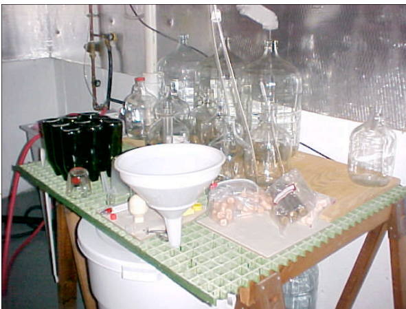
Fiberglass Grating Makes a Perfect Bottle Drying Table